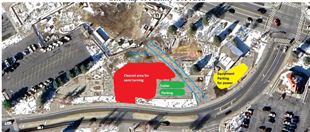
Site Map of Facility Use Area