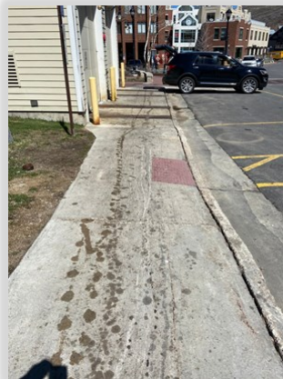
Avoid tracking grease down sidewalks to garbage facility- use a lid or secondary containment.