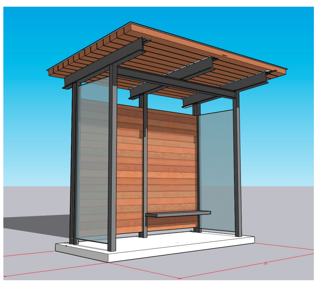
Professional Services Agreement – Commissioned Art (10-23) | pg. 12