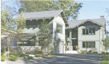
Garages tucked under Second Story Elements or Side Loaded