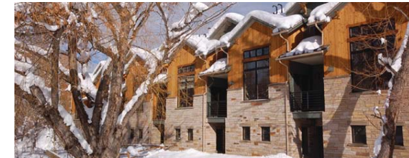
Varied Wall Planes