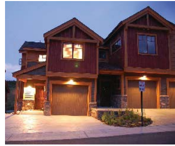
Low Sloping or Flat Roofs - Deep Overhangs