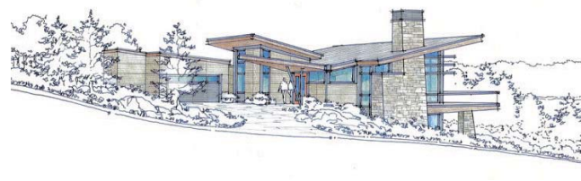
Simple Forms with Side wings and Porches added to Create more Complex Shapes