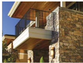
Exposed Structural Elements in Roofs and Porches