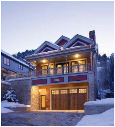
Emphasis on Front Door with Varied Porch and Accesses to work with Grades