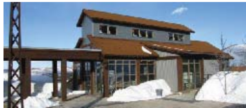
Unpainted Metal Roofing and Shingled Roofs