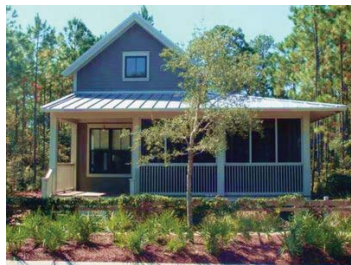
Garages Secondary to Home and Street