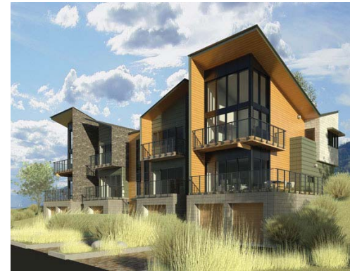
Not Resort Mountain Timber