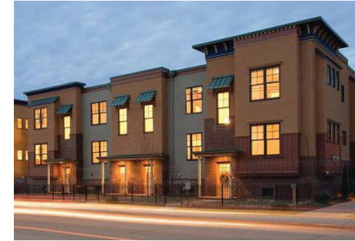
Mountain Contemporary Simple Forms