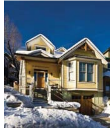
Small Front Yards emphasizing connection between Homes and Street