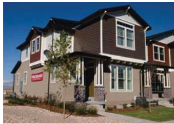
Emphasis on Raised Front Porches