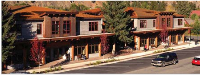
Exposed Structural Elements in Roofs and Porches