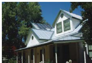
Exposed Structural Elements in Roofs and Porches