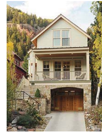
Emphasis on Broad, Raised Front Porches