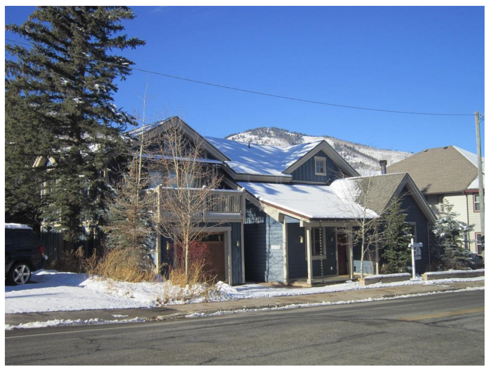
1359 Park Avenue. Southeast oblique. November 2013.