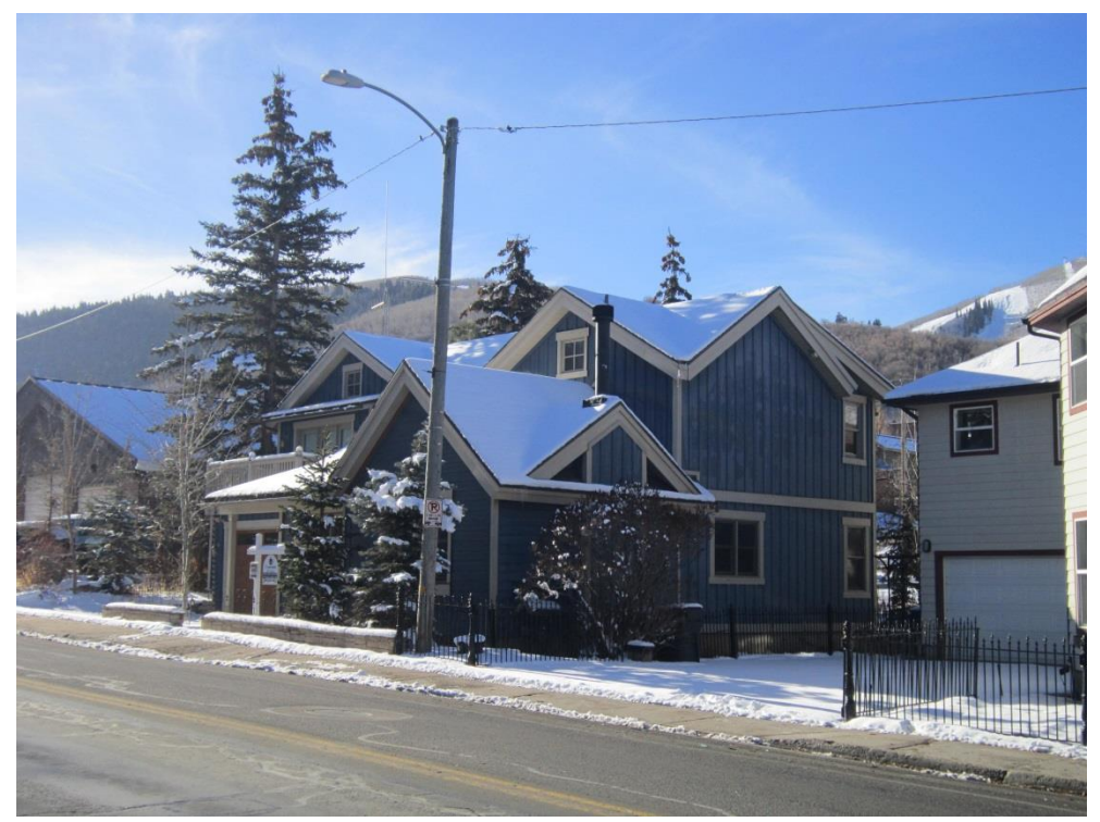
1359 Park Avenue. Northeast oblique. November 2013.