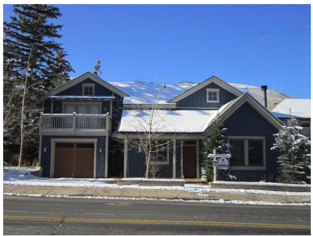
1359 Park Avenue. East elevation. November 2013.