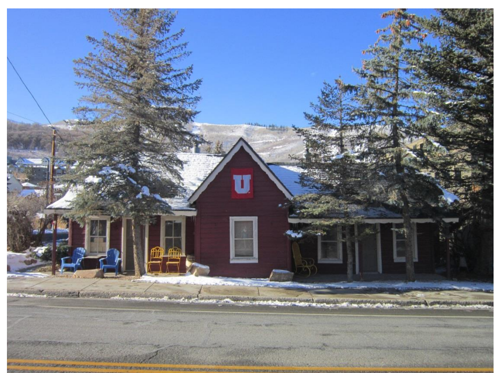
1301 Park Avenue. East elevation. November 2013.