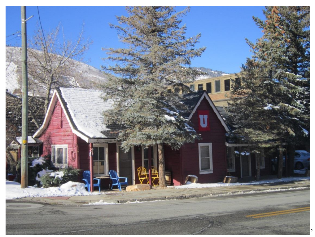
1301 Park Avenue. Southeast oblique. November 2013.