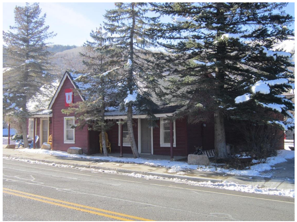
1301 Park Avenue. Northeast oblique. November 2013.