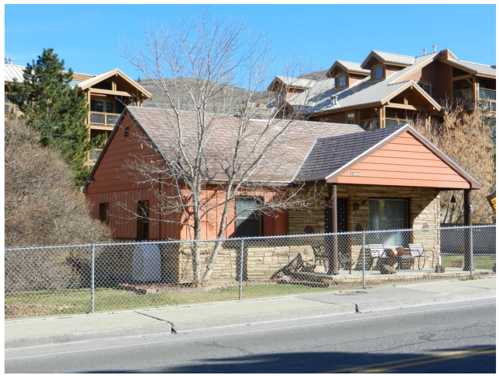
1060 Park Avenue. Northwest oblique. November 2013.