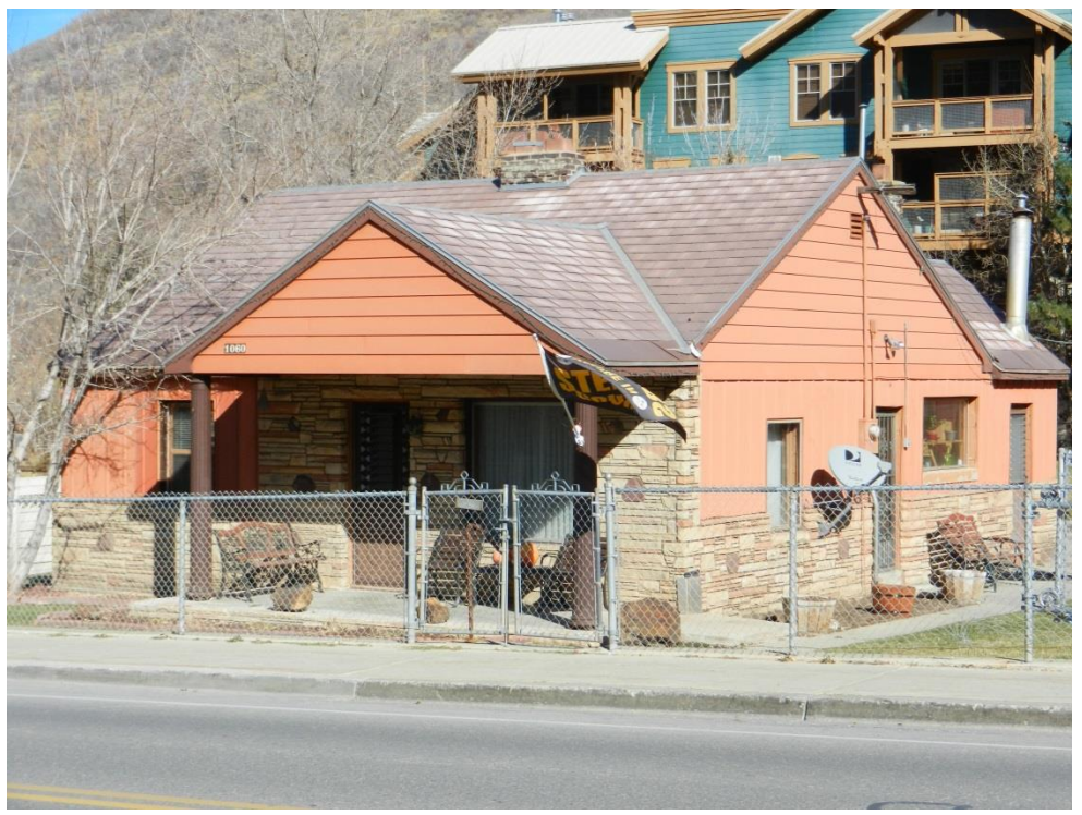
1060 Park Avenue. Southwest oblique. November 2013.