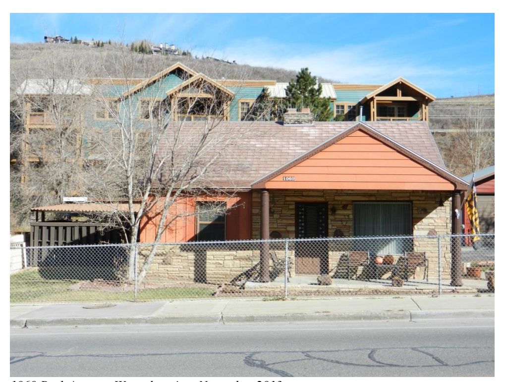
1060 Park Avenue. West elevation. November 2013.