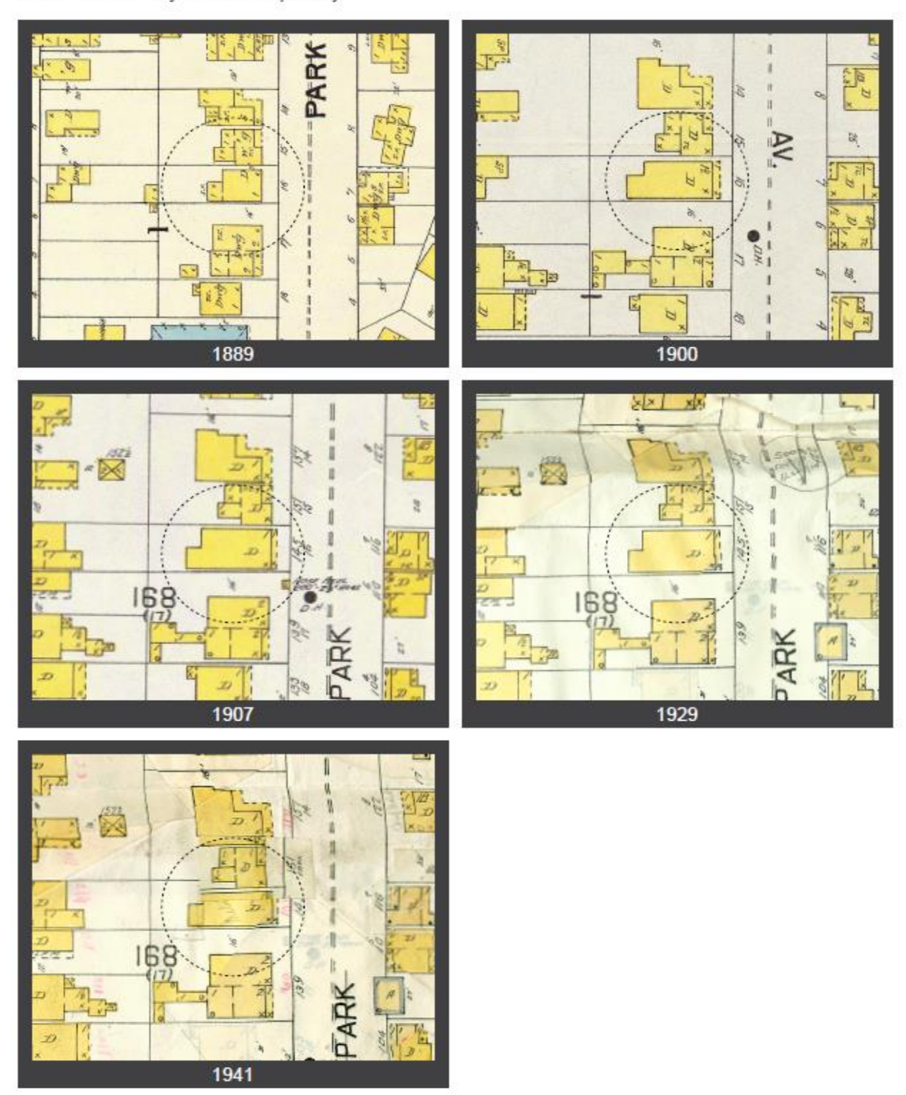
145 Park Avenue, Park City, Summit County, Utah Intensive Level Survey—Sanborn Map history