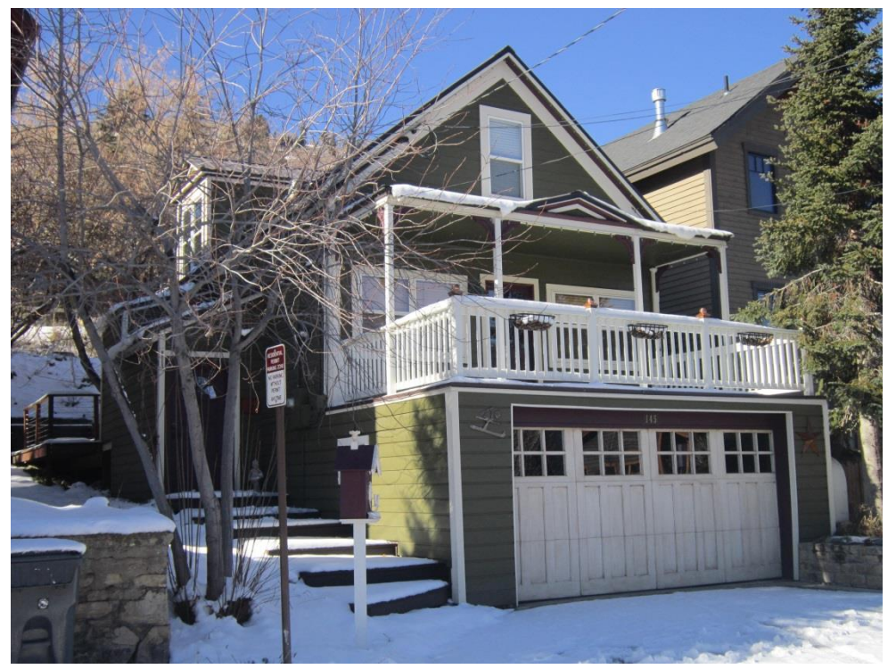
145 Park Avenue. Southeast oblique. November 2013.