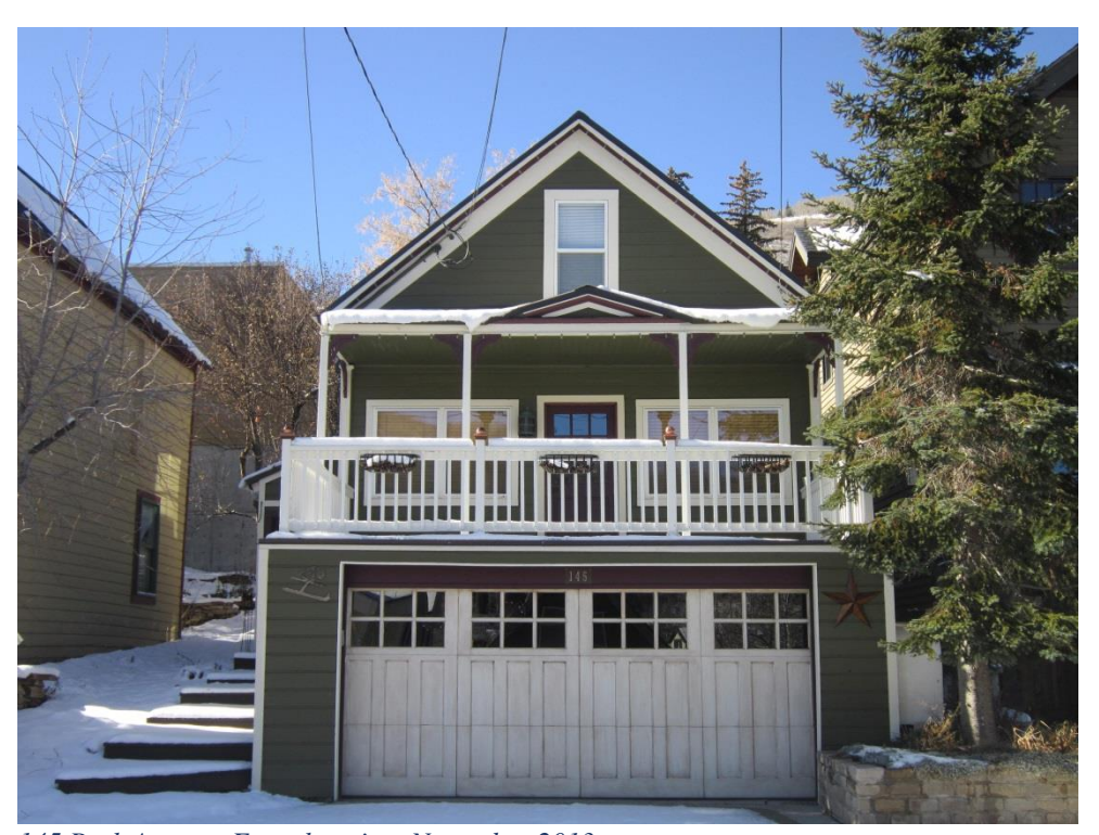
145 Park Avenue. East elevation. November 2013.