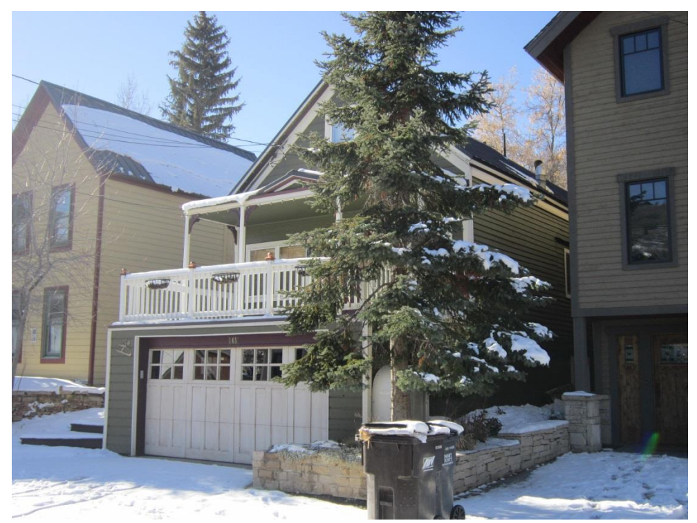
145 Park Avenue. Northeast oblique. November 2013.