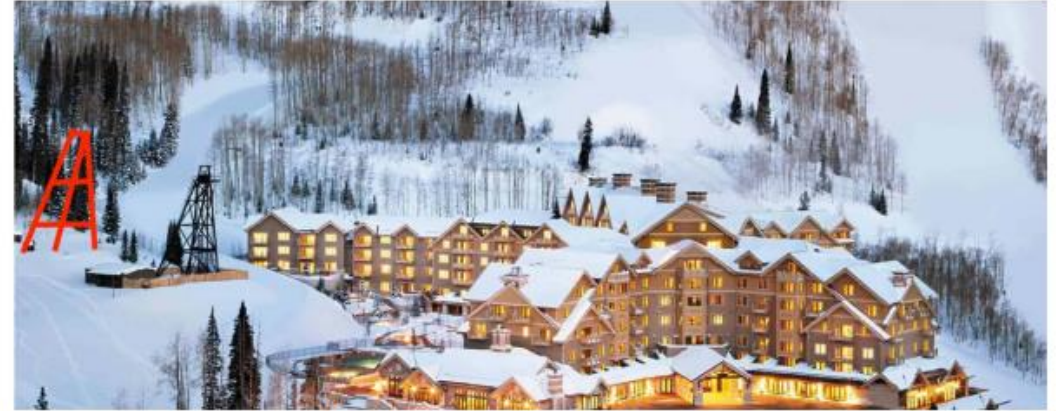
Photo showing proposed headframe location relative to Montage and original location