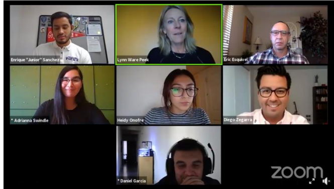
Municipio de Park City, Utah's Video