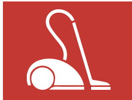
Vacuum Cleaner 70dB