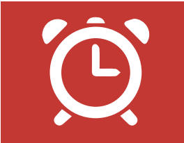
Alarm Clock 80dB