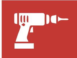
Hand Drill 90dB