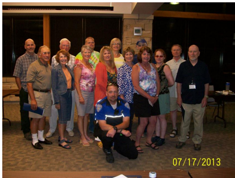
2013 Citizen Academy

The Public Safety Department, which is comprised of the Police Department and the Communications Center, offers a wide variety of services and programs to the community, its citizens and our guests. As outlined in our department mission statement, it is the desire of the Public Safety Department to work closely with the community to create partnerships that will address issues, solve problems and maintain our quality of life.