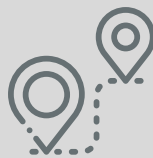
Transit Boardings (Millions)

20 added regional transit trips on PC-SLC Connect and Kamas Commuter routes.