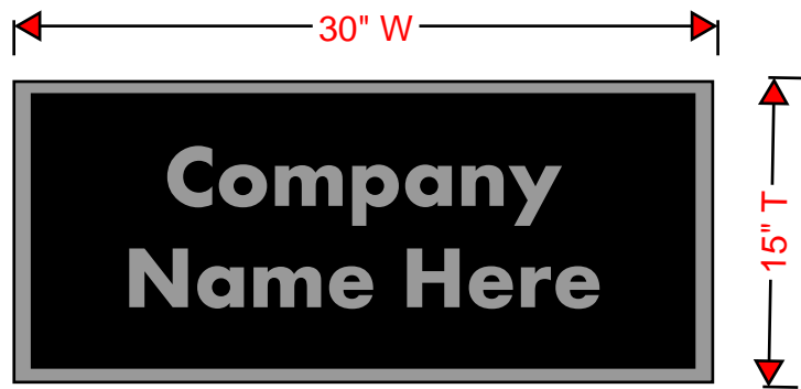
Exhibit A - Front Profile