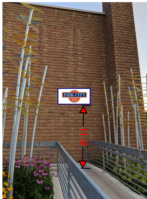
Exhibit D - Location of Existing Sign -Dimensions: 30" W x 15" T