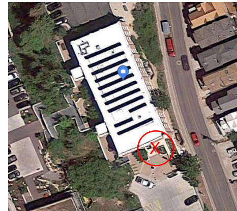
Exhibit E -Proposed Location of Sign, Aerial