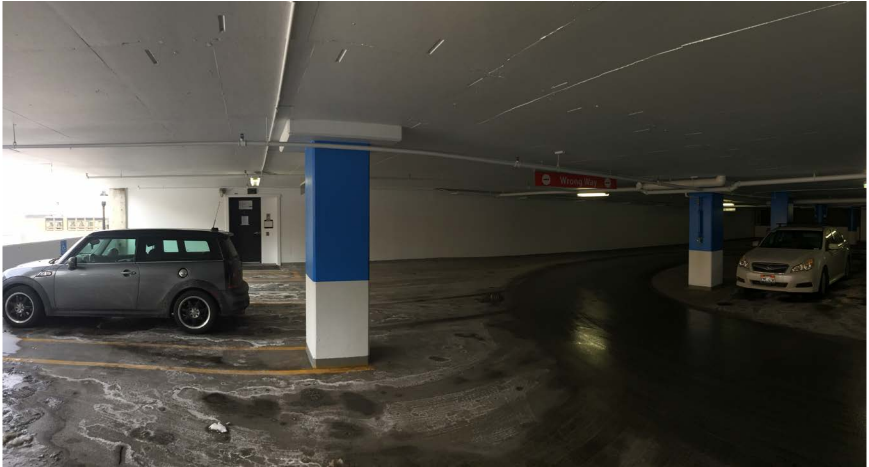
Level 2N - KPCW