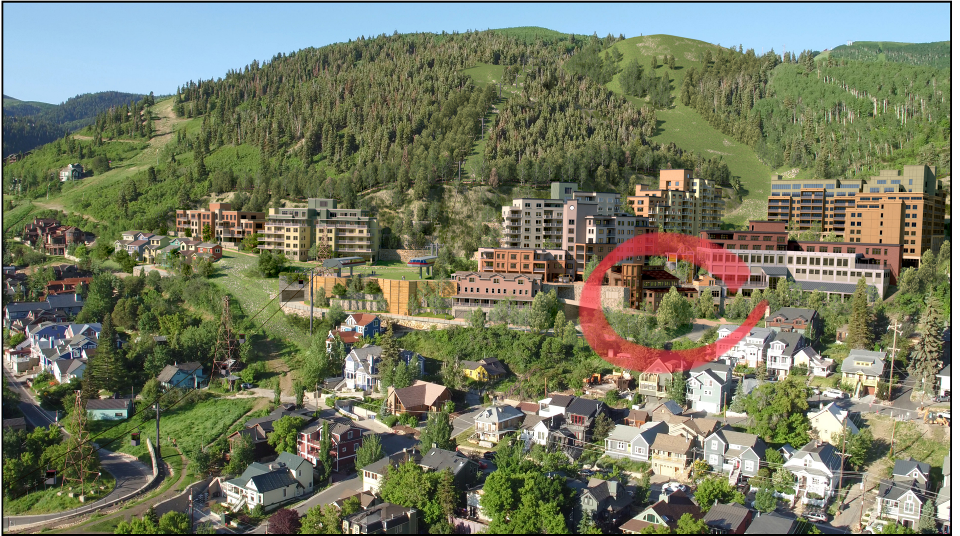
Slide 3-20171025 EMPLOYEE HOUSING