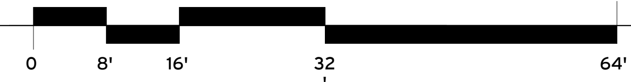
2 TOWNHOME MAIN LEVEL SCALE: 3/32" = 1'-0"