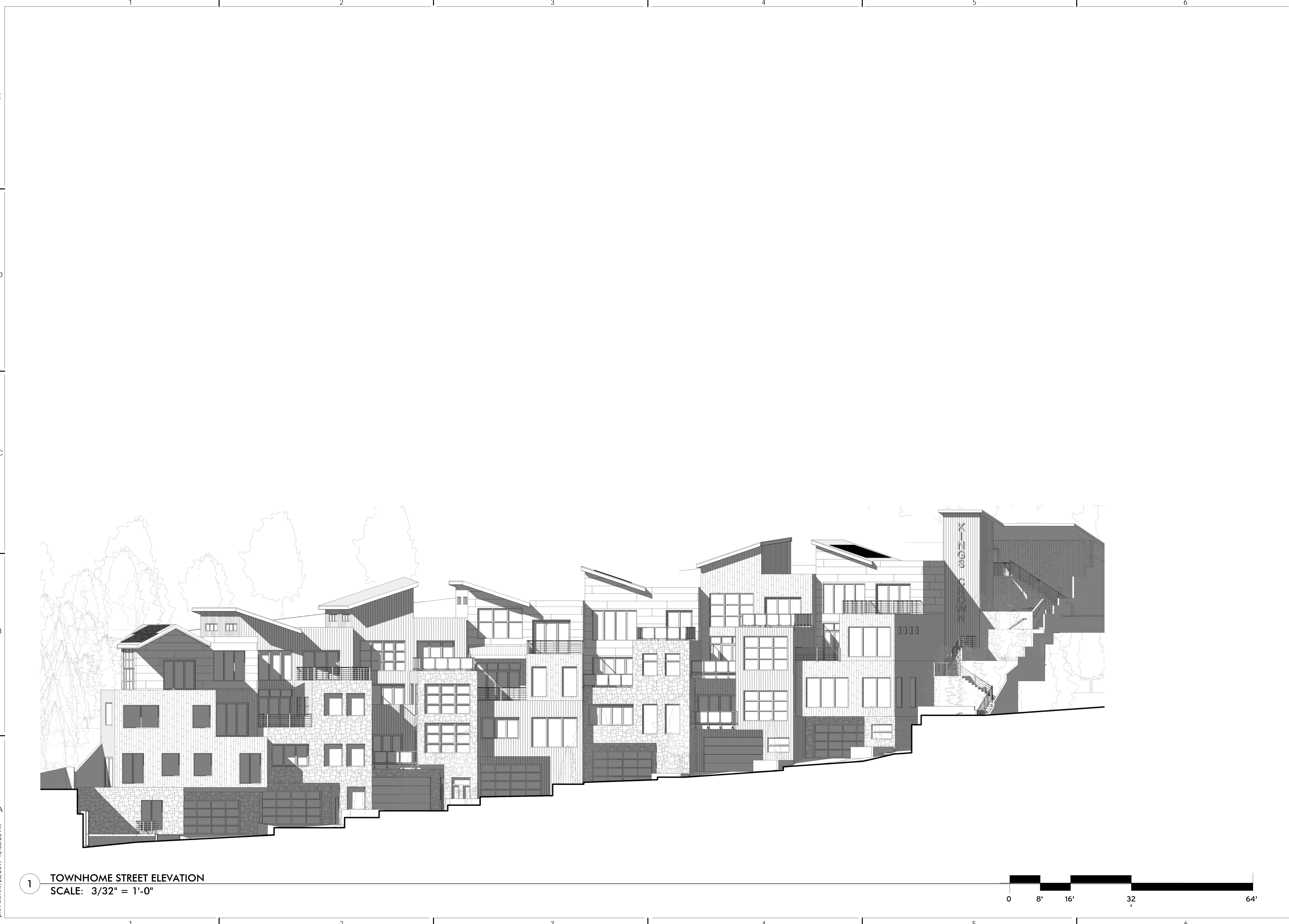
1 TOWNHOME STREET ELEVATION SCALE: 3/32" = 1'-0"

the concepts, ideas, drawings and specifications herein are an original unpublished work and the property of WOW Ateller, LLC and shall not be used on any other work. do not scale drawings. all conditions shall be verified on site. discrepancies shall be brought to the attention of the architect before proceeding. plot date: 9/28/2017 12:03:20 PM