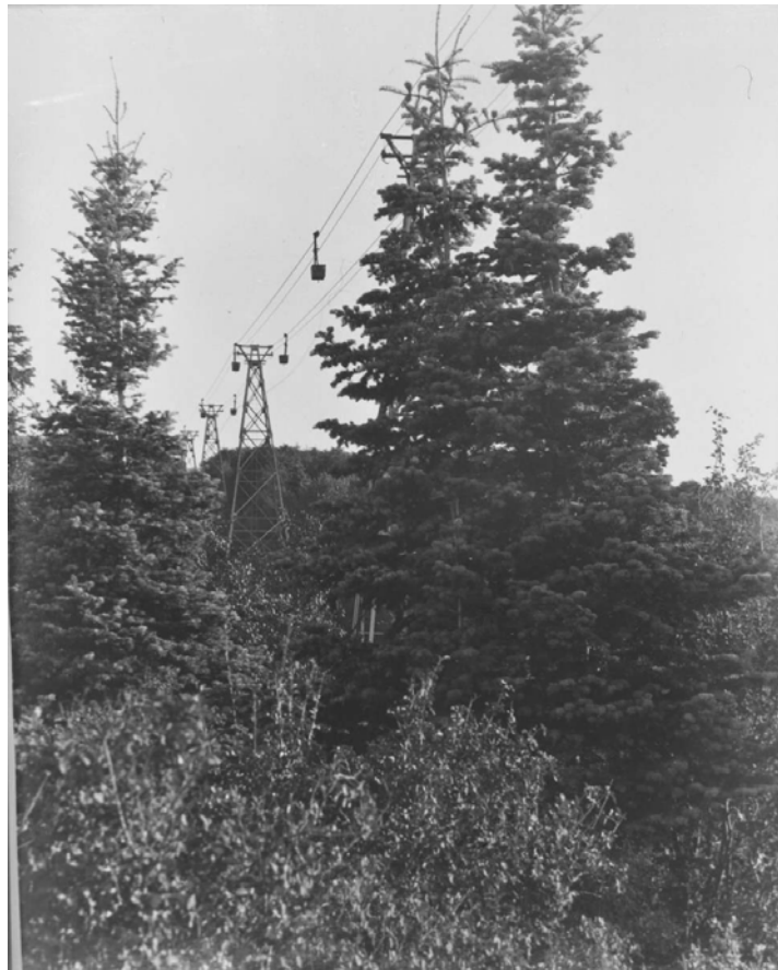
Silver King Aerial Tramway. N.d.