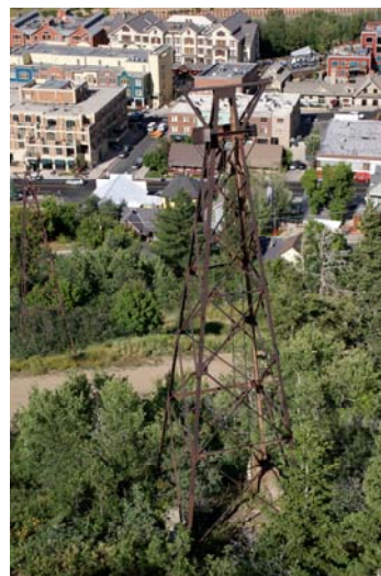
Tram Tower 4