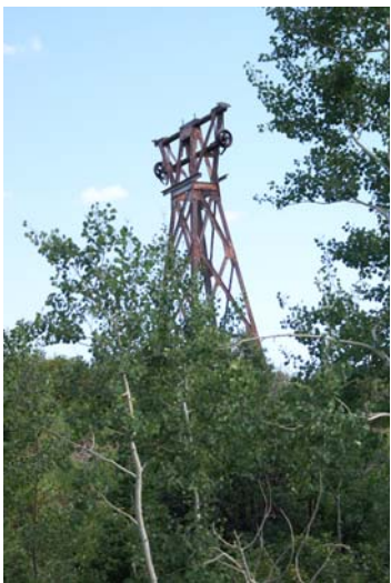
Tram Tower 35