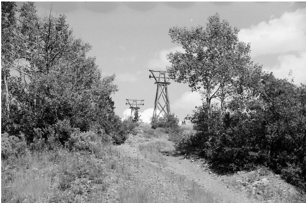
Tramway Towers 1999 RLS