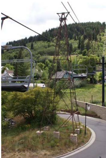
Tram Tower 1