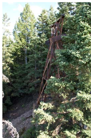
Tram Tower 6