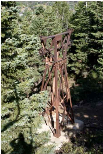
Tram Tower 7

Silver King Mine Aerial Tramway Site - Towers shown are those visible from the Town Lift