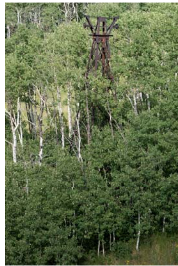
Tram Tower 28