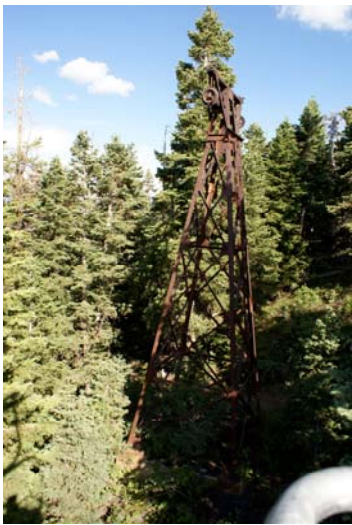
Tram Tower 11