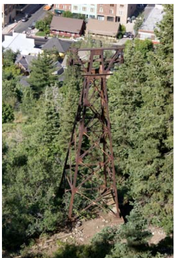
Tram Tower 5