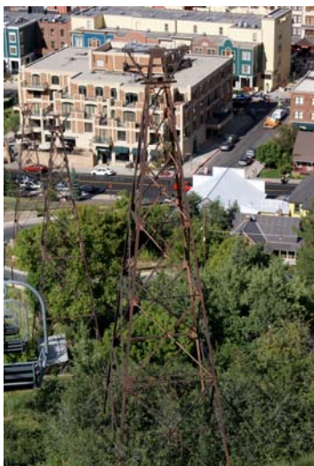
Tram Tower 3