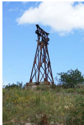
Tram Tower 36