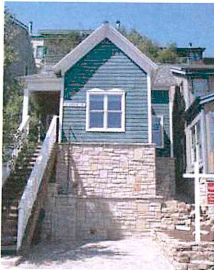
Landscaping and site grading, particularly in the front yard setback, are important elements in defining the character of the street. Unlike the example above, original grading in the front yard setback and compatible landscaping should be maintained.