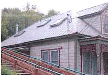
These skylights are flush mounted and unobtrusive when viewed from the public right-of-way.

B.1.2 New roof features, such as photovoltaic panels (solar panels) and/or skylights should be visually minimized when viewed from the primary public right-of-way. These roof features should be flush mounted to the roof.