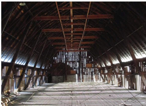
Existing Conditions: cable-bracing system