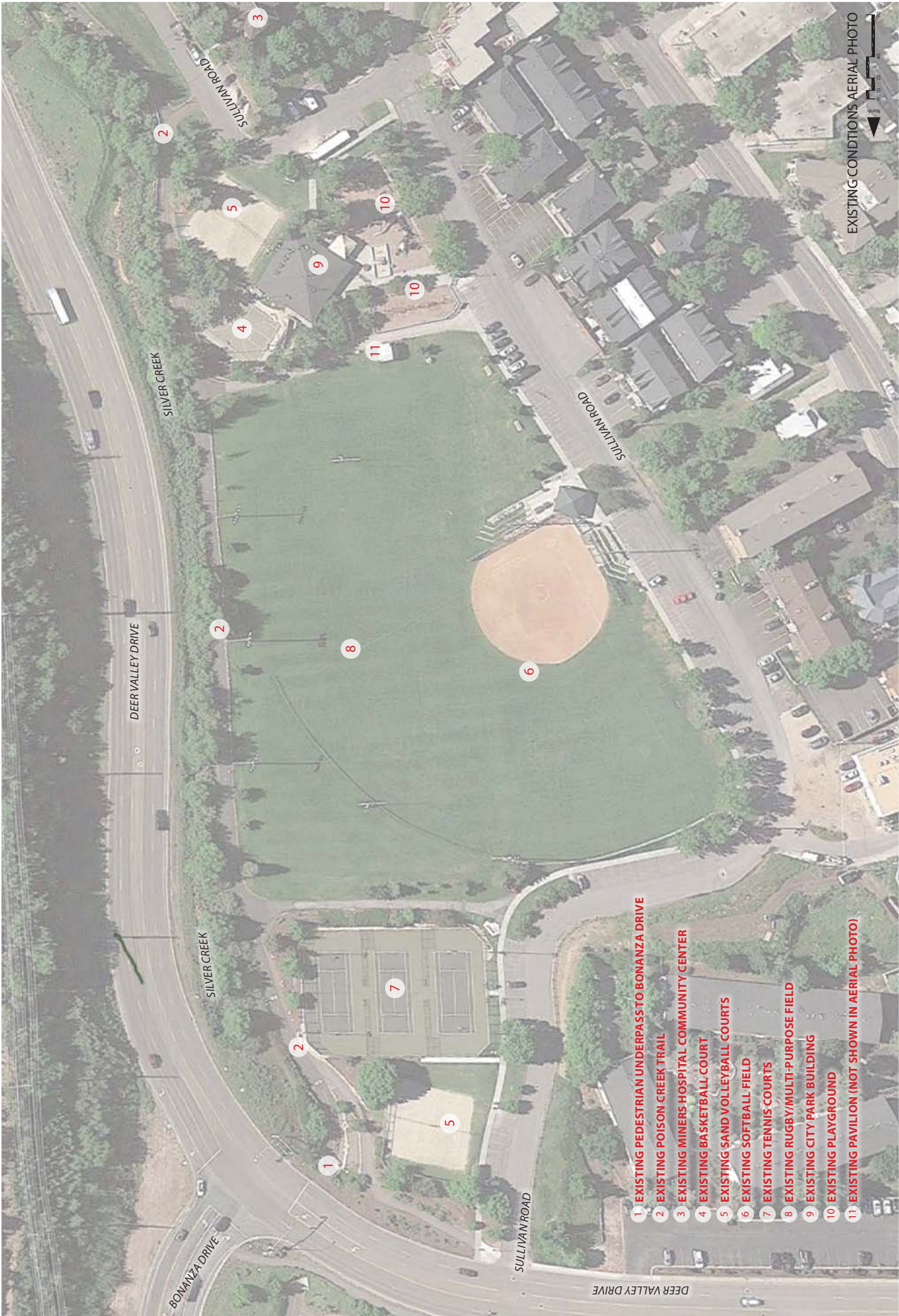
EXISTING CONDITIONS AERIAL PHOTO