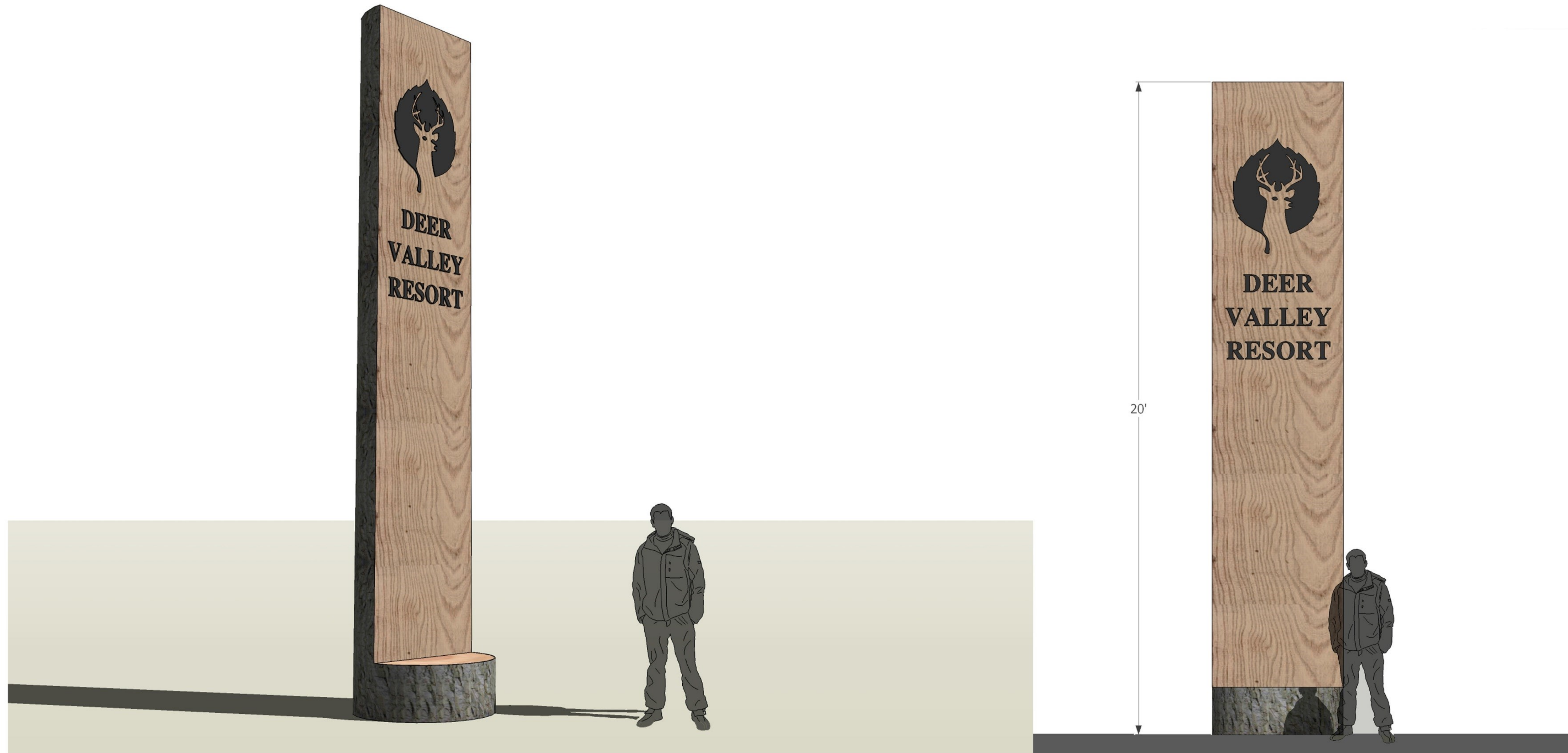
Park City. Street Scape | Resort Entrance Feature