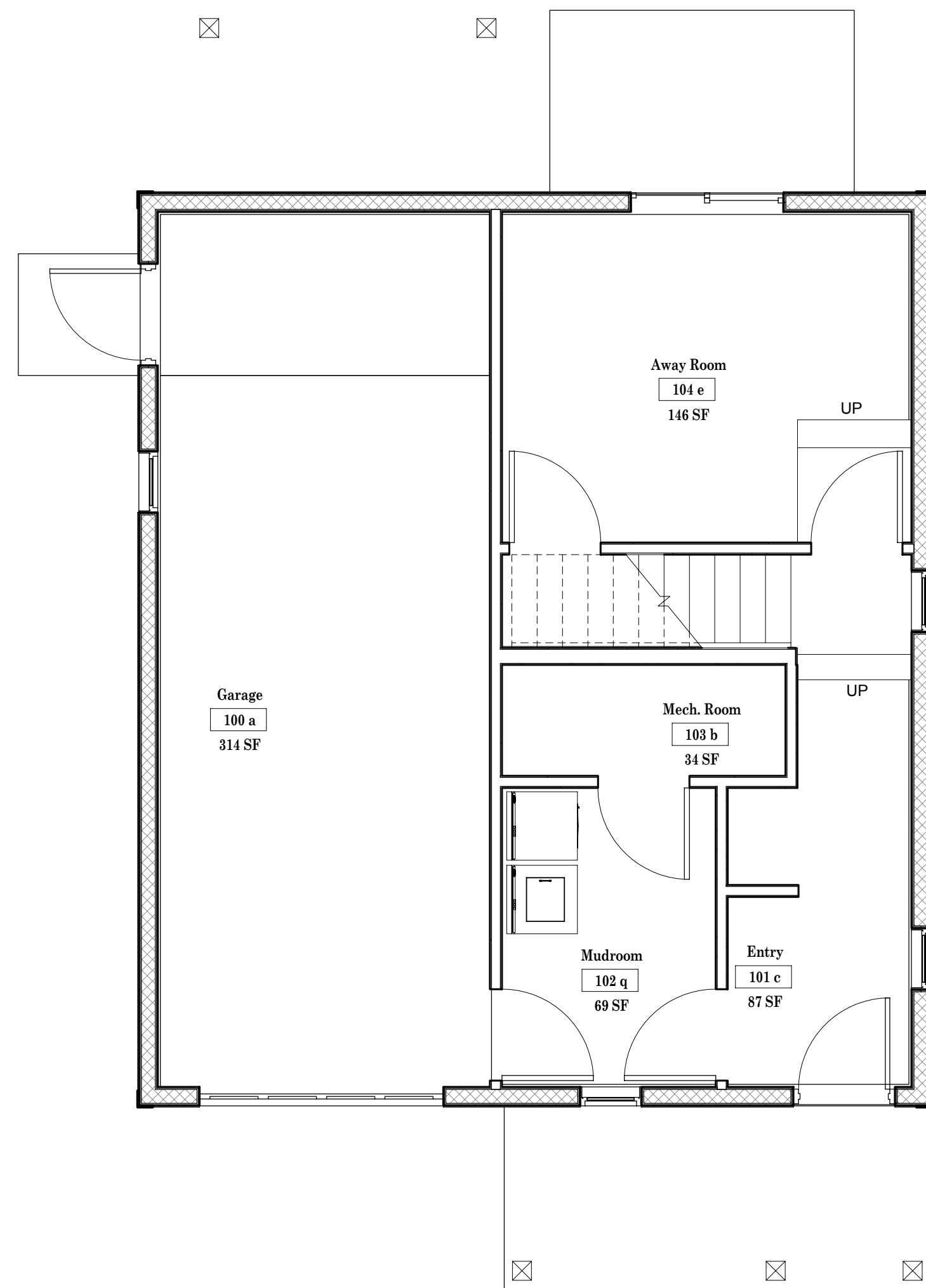
1 LEVEL 1 SCALE: 1/4" = 1'-0"