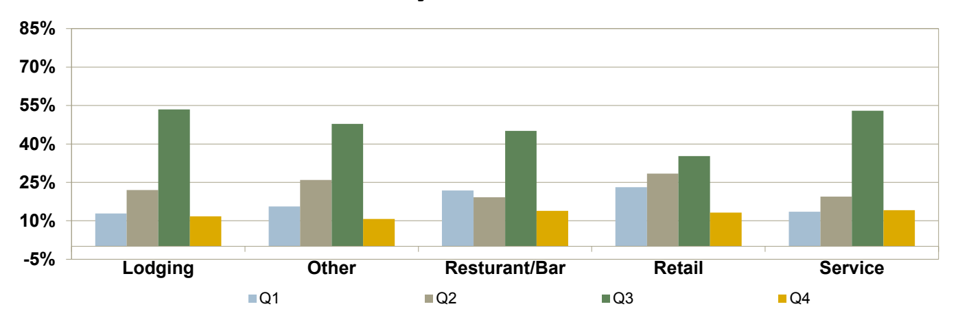
Figure 3 - Percent of Estimated Taxable Sales by Fiscal Quarter