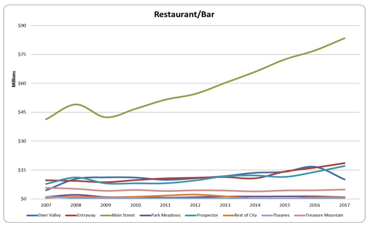
Figure 2 – Restaurant/Bar Industry Estimated Taxable Sales by Geo